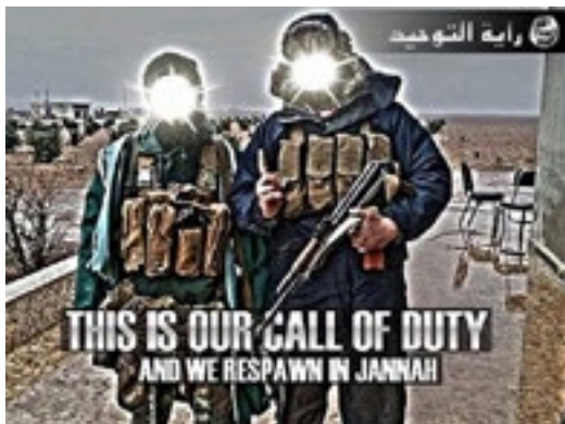
Figure 1: 'Jihadi Cool'.