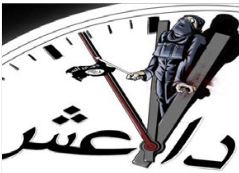
Figure 3: The Image from a Coalition Leaflet Air-Dropped over Syria.

Source: US Central Command; also available at < http://www.usatoday.com/story/news/world/2015/06/04/pentagon-propaganda-syria-isil/28470813/ >, accessed 30 September 2015.